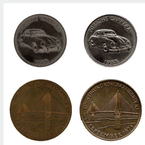
2D scan versus 3D scan, capture all details