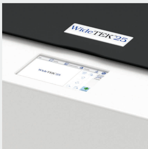
Large color touchscreen for simplified operation