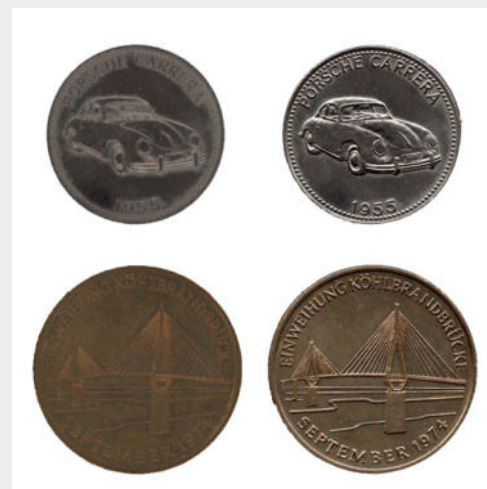
2D scan versus 3D scan, capture all details