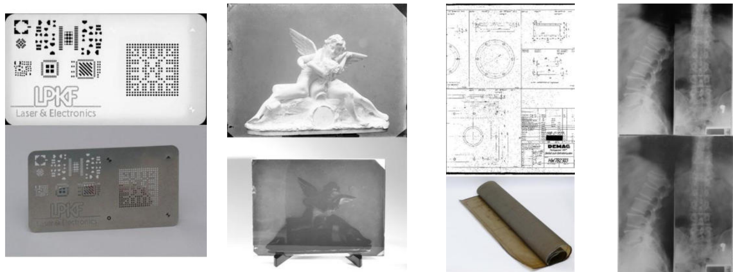
Scan results from the WideTEK 25 with backlight unit. The top images are scans of source material using the backlight unit, below them are high quality photos.