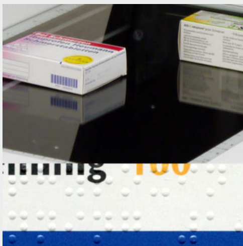
Quality control of print and braille on cardboard