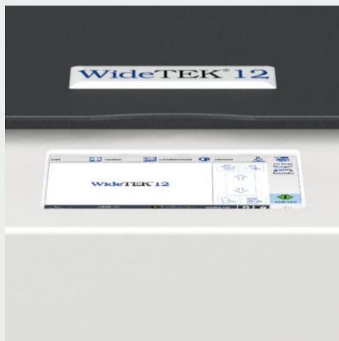
Large color touchscreen for simplified operation