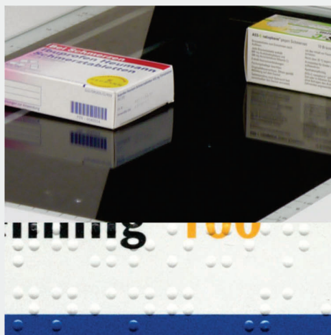
Quality control of print and braille on cardboard