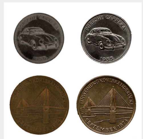
2D scan versus 3D scan, capture all details