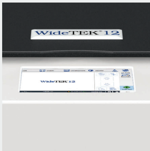
Large color touchscreen for simplified operation