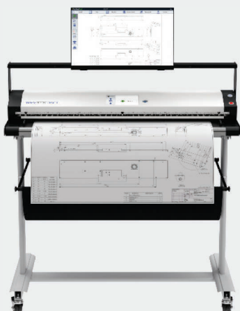
Large documents like maps rewind to the front or fall into the paper catch.

The WideTEK® 36CL produces extraordinarily sharp images, with color accuracy even superior to competing CCD scanners. Document rotation is done on the fly, a scan of an E-sized / A0 document in portrait mode at 300 dpi in 24bit color takes less than 7 seconds to scan and another 2 seconds to crop & deskew, preview and store.