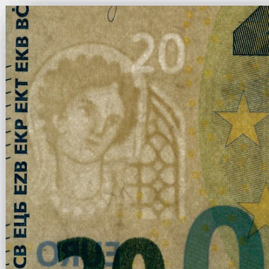
Backlight shows watermarks