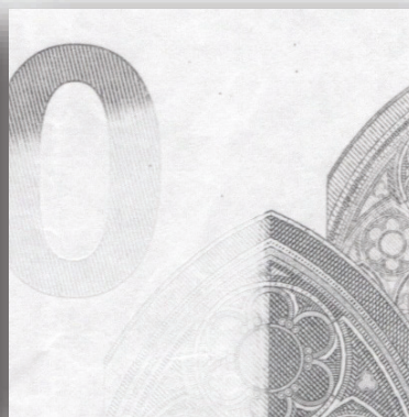
IR-light proves banknote's IR response