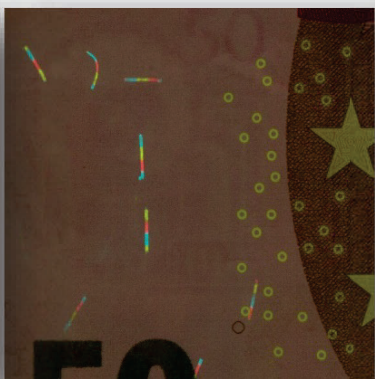
UV-light excites fluorescent ink and fiber