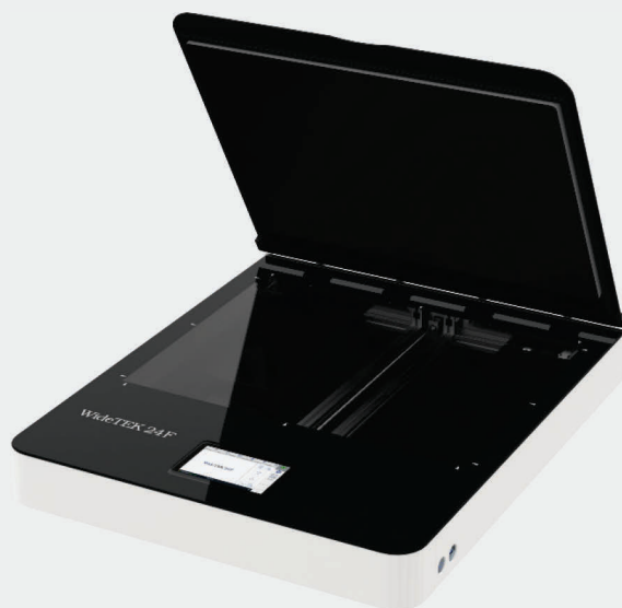
Scratch resistant glass plate enables scanning oversized originals