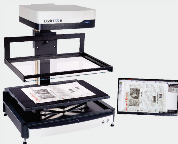
Scanning newspapers up to A2 with flat glass plate.

The book cradle enables perfect scans while protecting the book binding. The V-shaped glass plate can be removed in a few simple steps. Depending on requirements, the BookTEK® 5 V2 Archive can now be used with an optional flat glass plate or without a glass plate at all.