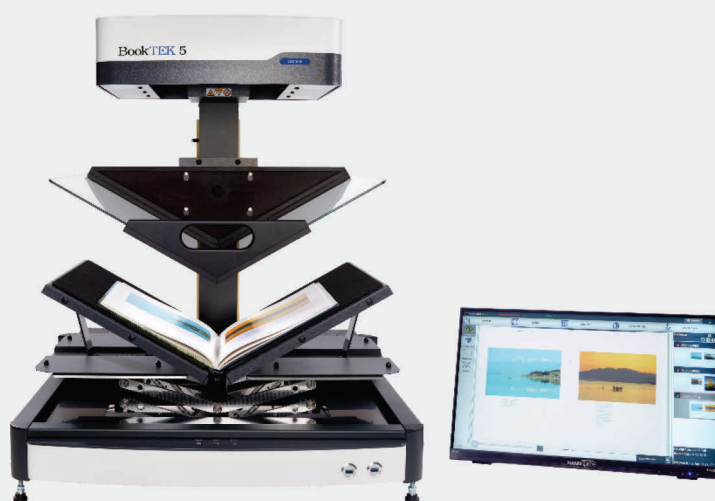
Scanning highly glossy originals with V-shaped glass plate.